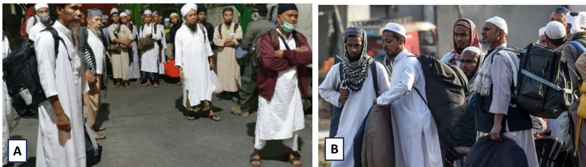
Figure 3. (A) Jama'ah Tabligh performing janlah ; (B) A Jama'ah Tabligh group from Bangladesh.

The Indonesian government issues no specific advisories or prohibitions regarding Jama'ah Tabligh. Furthermore, a fatwa from Dar al-Ifta al-Misriyyah (Egypt) regarding Jama'ah Tabligh states that the movement and its da'wah have made a significant contribution to spreading Islam across the globe, with no evidence of deviant practices. Therefore, Jama'ah Tabligh is not prohibited from interacting with the public or performing kburuj , as long as it does not lead to the neglect of other obligations (hidayatullah.com). Figure 3A shows general janlah activities (exposeindonesia.com), and Figure 3B is a photograph of a Jama'ah Tabligh group from Bangladesh performing kburuj in Indonesia (hidayatullah.com). Figure 3. (A) General janlah activities; (B) Jama'ah Tabligh group from Bangladesh performing kburuj in Indonesia.