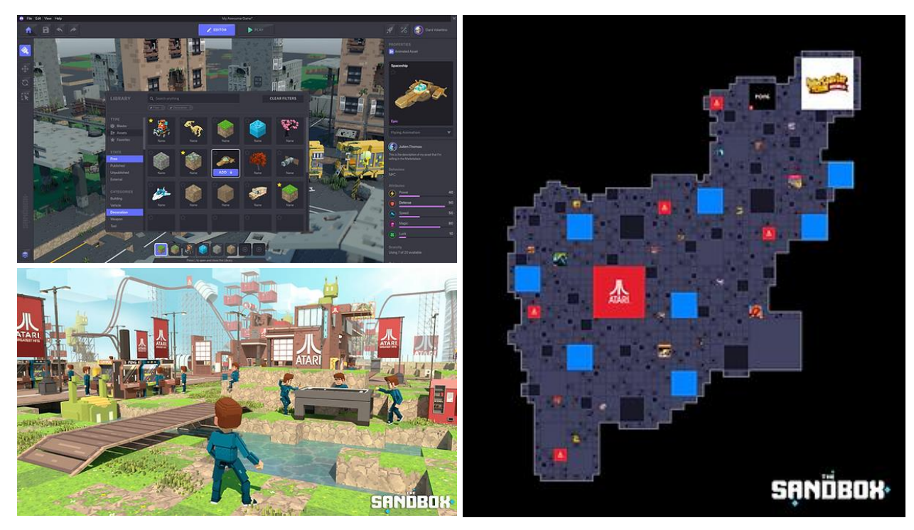
Figure 2. Sandbox and Atari collaborate to build a metaverse world (Sawyer, 2020)

Figure 2 below is the interface of one of the Metaverse sandbox platforms collaborating with the game company Atari. Sandbox is a virtual world where players can build, own, and monetize their voxel gaming experiences on the Ethereum blockchain. The team's vision is to offer a genuinely immersive metaverse where virtual worlds and games will be created collaboratively without a central authority. The Sandbox has three main components: a VoxEdit NFT (non-fungible token) creator for creating voxel game ASSET, a Marketplace for buying and selling ASSET, and a Game Maker tool where complete interactive games can be made and shared. It is reported that more than 350 million users of the Fortnite Battle Royale game globally have spent 3.2 billion hours playing. Meanwhile, Roblox players have reached 140 million, which is larger than the populations of Canada, Spain, Australia, and Colombia.